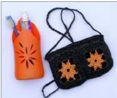
Two attractive items made from recycled plastic bottles and bags.