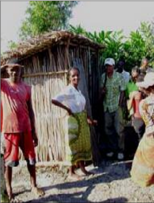
Showing off the new latrine!

Another focus of attention in this area is sanitation. Latrines are still not universally used (and in fact are taboo in certain parts of the country), but SAF is working on it. When the co-ordinator visited last year there was much banter, and considerable pride, when the inhabitants of one village showed her the new latrine that they had built behind their church. Local pastors are proving great allies in this campaign.