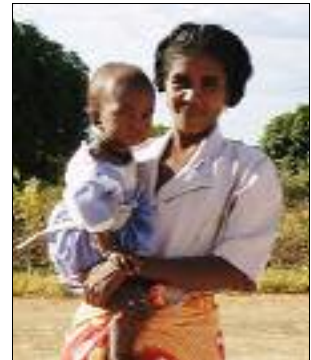
A member of the FIVEMI women's group and her baby

The latter grows quickly and provides useful timber for building while most of the native species are slower growing but will provide materials in the future for craft work and essential oils.