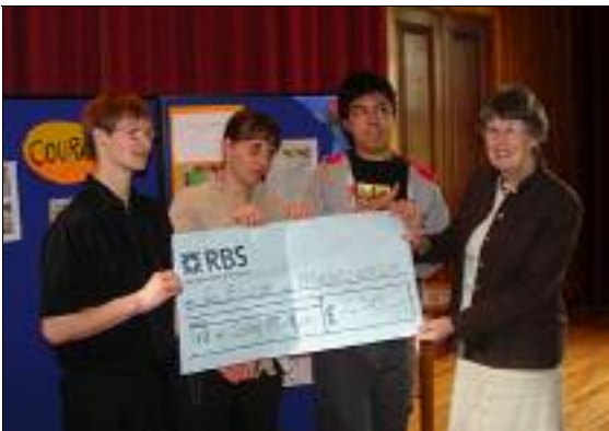
Students at Coleg Elidyr in Wales presenting a cheque to the Co-ordinator for work at La Source.

Until the present crisis the Centre was self-supporting. Income from sale of craft work and catering for marriages and other family celebrations was sufficient to cover the basic running costs. Many of the girls went on to get jobs in the clothing factories. Sadly, since the crisis erupted in March 2009, the factories have all closed, there are few tourists to buy the craft work and people have no money to pay for lavish wedding parties, so the Centre lost all its sources of income at a stroke. MfM gave them an emergency grant to allow them a little time to look for new sources of income.