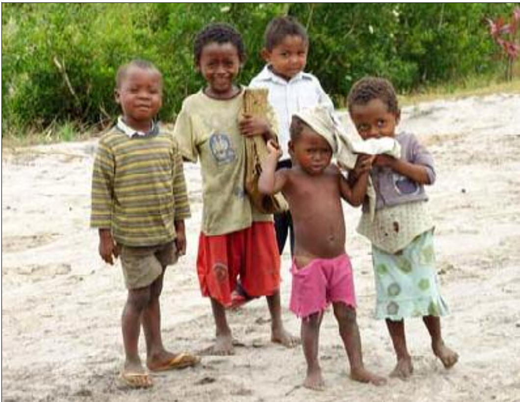
Children in a cyclone affected village where MfM funded emergency food distribution.

concerning the financial year 26th Sept. 2008—25th Sept. 2009