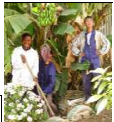
La Source students at work in the school garden there will soon be bananas for dessert !

For details see our website www.moneyformadagascar.org/appeal or contact us at info@moneyformadagascar.org .